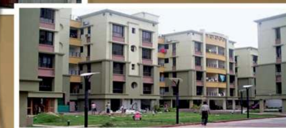
▲ Daffodil Residency

“Child is the father of man” – William Wordsworth