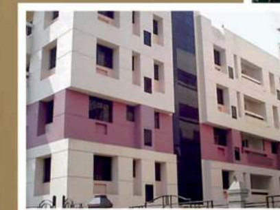
▲ Daffodil Greens