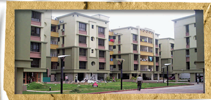
▲ Daffodil Residency