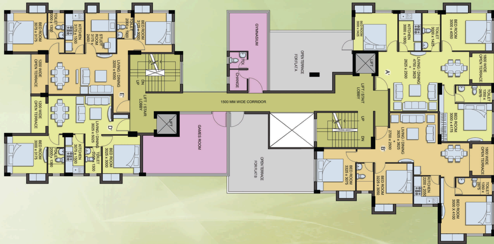
7th Floor Plan