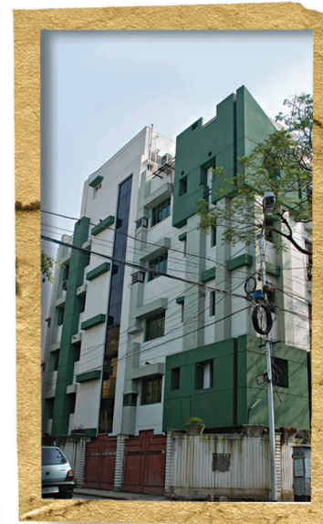
▼ Daffodil Nest