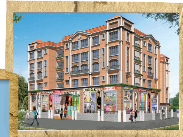
▼ Daffodil La-Bella