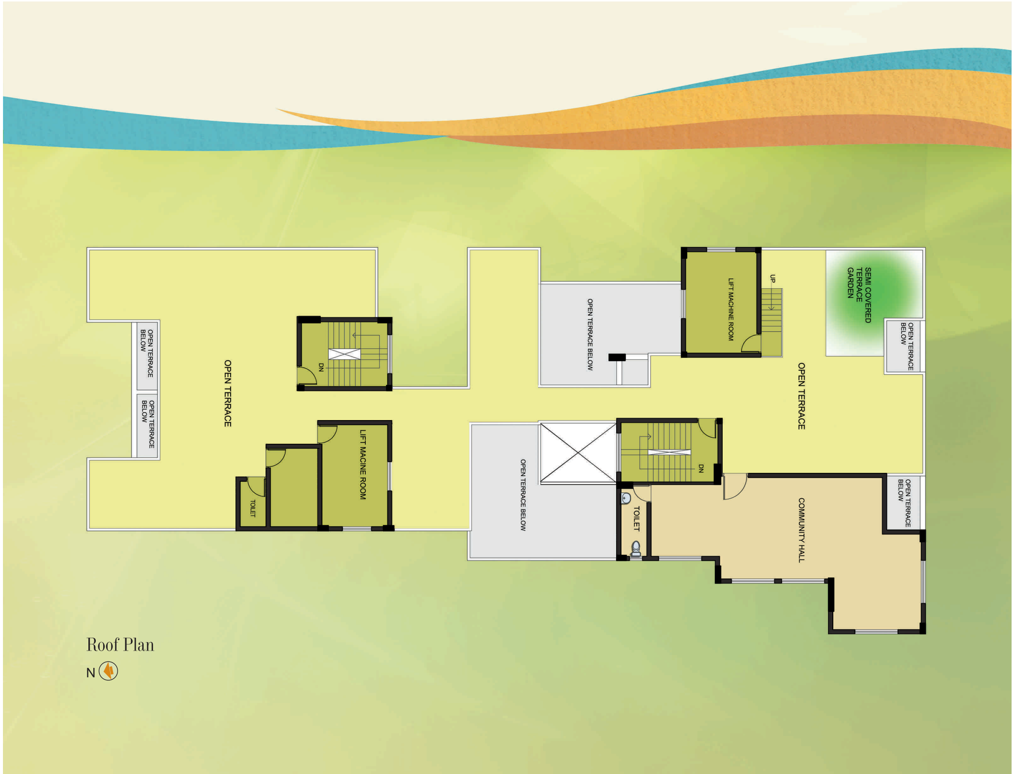
Roof Plan N