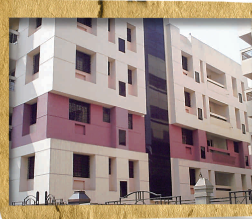
◀ Daffodil Greens